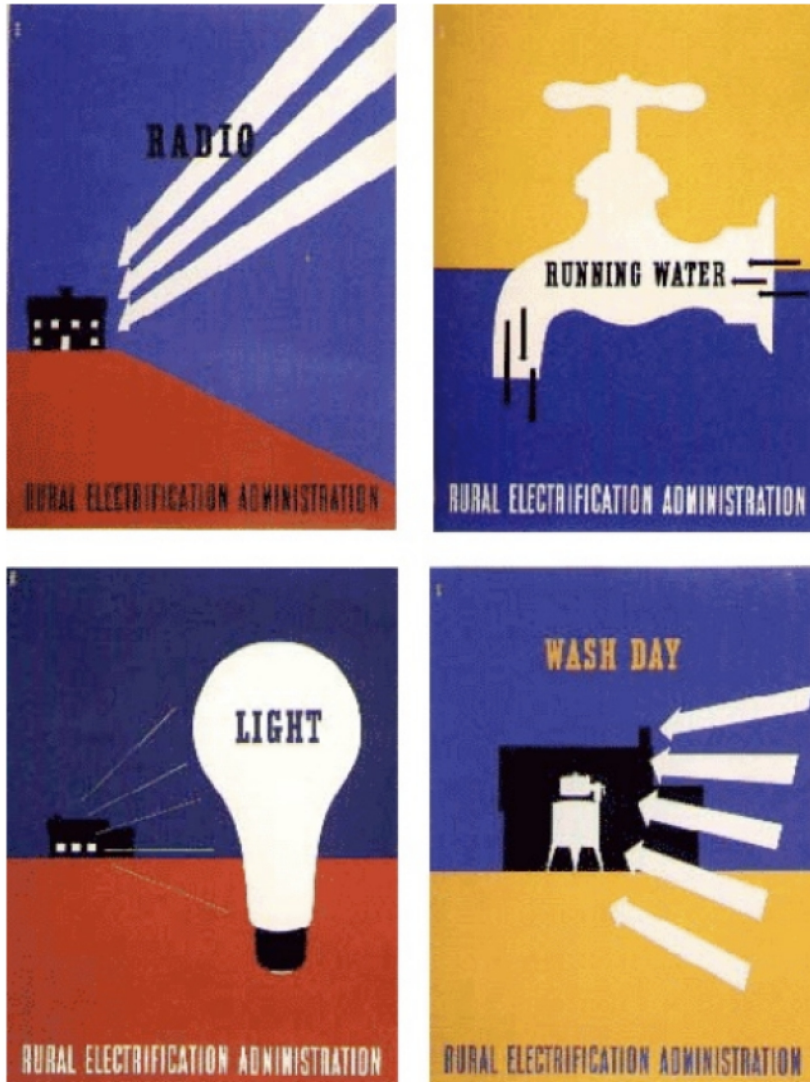
Rural Electrification in 1935; Broadband and Green Electricity Today

The second reset brought about the expansion of the highway system, rural electrification, new universities and a rebuilding of the education system and the start of the great suburban experiment.